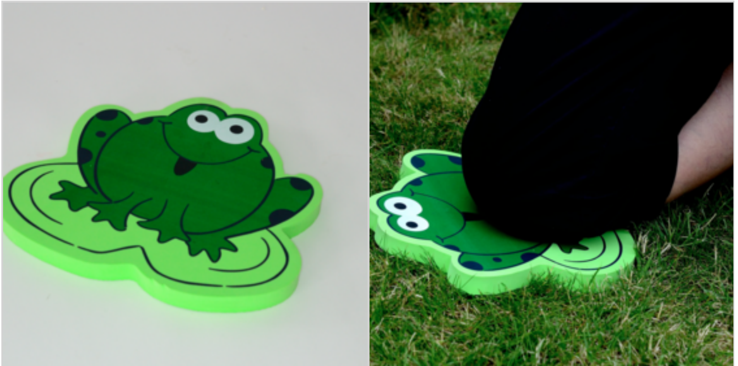
Garden kneeling pad